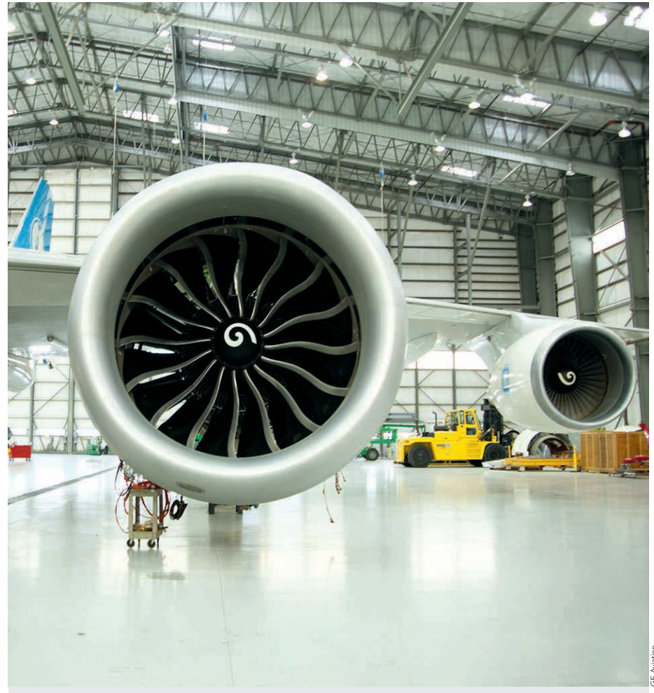
Six of 10 biggest businesses are based in North America, including GE Aviation